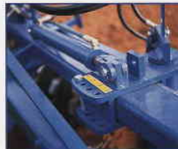
Adjustable operating width of gangs.