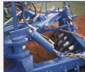
Hydraulic control for easy handling.