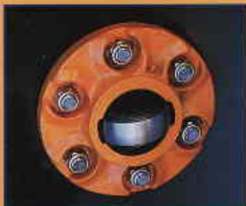
Twist out greasable bearings for ease of service and minimum downtime.

To control the desired bank or channel dimensions, simply set the gang angles to the conditions and adjust the hydraulic gang spacing.