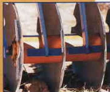
Patented Floppy 'T' Bar scrapers control soil or trash build up on axle spools.